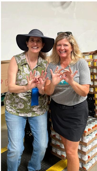
Volunteering at the Jacobs & Cushman San Diego Food Bank